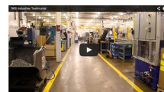
WSI INDUSTRIES Monticello, MN

Please be advised that the Applicable Education Standards are set to Minnesota state standards .