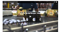
GRAPHIC PACKAGING Crosby, MN