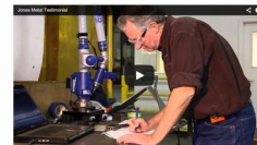
JONES METAL Mankato, MN