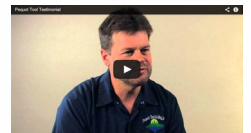
PEQUOT TOOL & MANUFACTURING Pequot Lakes, MN