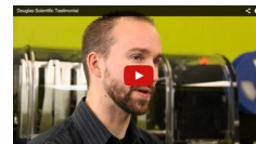
DOUGLAS SCIENTIFIC Alexandria, MN

Introduce your students to manufacturing by showing them one of the following videos: